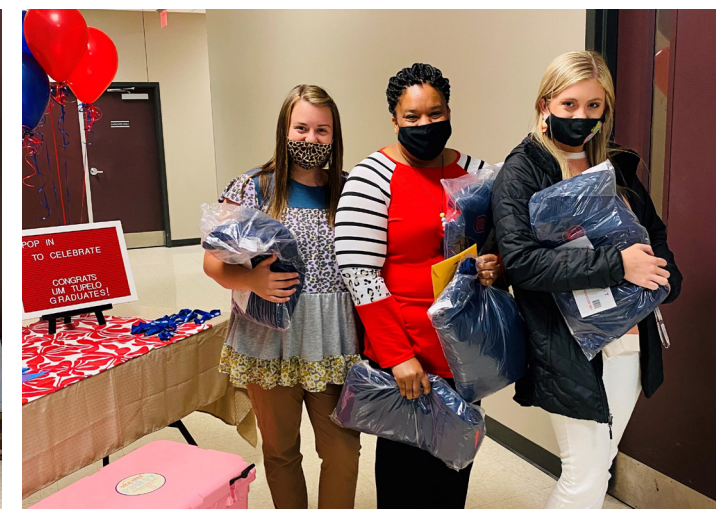
"Pop In" to celebrate 2021 graduates