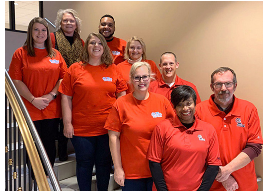
UM Tupelo staff dressed in Rebel Red on National Wear Red Day

The University of Mississippi-Tupelo and Booneville campuses are operated by the University of Mississippi Division of Outreach