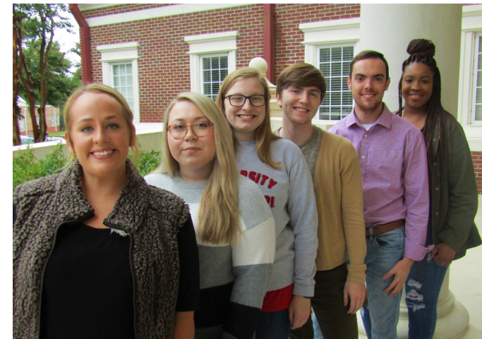
Legal Studies Student Association

This student organization allows criminal justice and paralegal studies majors at the UM-Tupelo campus to network with others in the profession as well as become involved in training and community service projects.