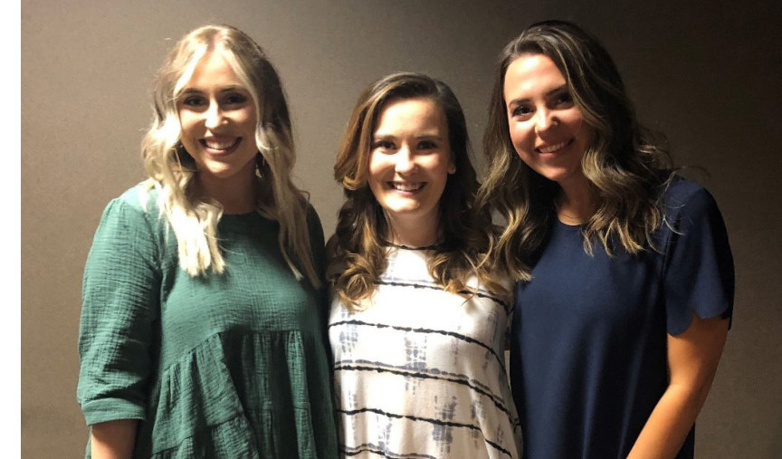
Teachers of Tomorrow

TOT members participate in several community service projects geared toward assisting children, including school supply drives and events for children involved in the Tupelo Boys and Girls Clubs.