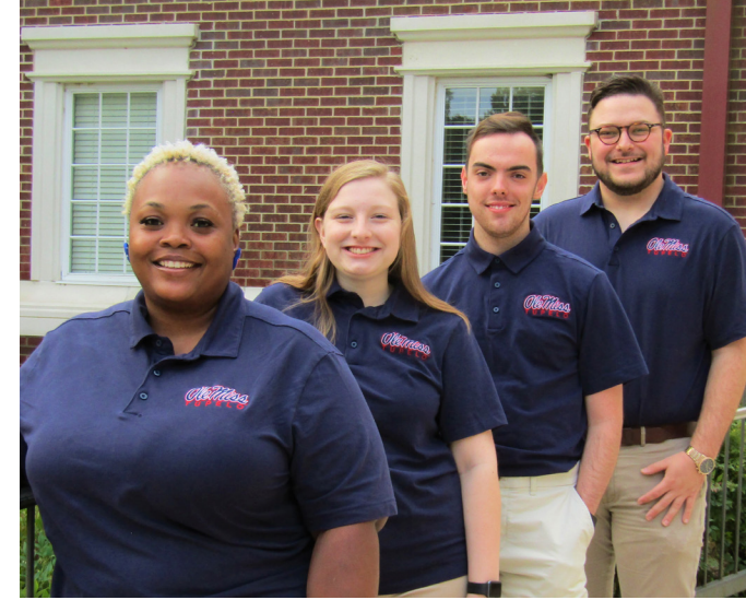
UM-Tupelo Student Ambassadors

UM-Tupelo Student Ambassadors are chosen based on student involvement, grades, character, and passion for the University of Mississippi. As representatives for UM-Tupelo, student ambassadors participate in activities on campus and in the community. Student ambassadors are a vital asset to the UM-Tupelo campus communications team. If you are interested in becoming an ambassador please complete an application in the UM-Tupelo office. There is a $250 semester scholarship available.