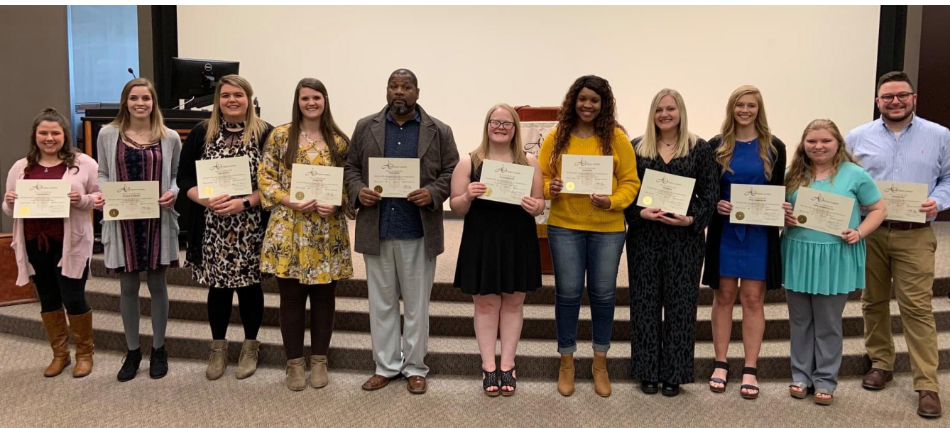
Alpha Sigma Lambda Honor Society 2020 Inductees

This unique academic honor society seeks to recognize the special achievements of adults who accomplish academic excellence while facing competing interests of home and work. ASL recognizes high scholastic achievement in an adult student's career. Students inducted into the UM-Tupelo ASL chapter meet certain academic standards which include having no less than a 3.5 cumulative grade point average on all college work and at least 24 credit hours from UM-Tupelo. Inductions into the UM-Tupelo chapter of ASL are held each Spring.