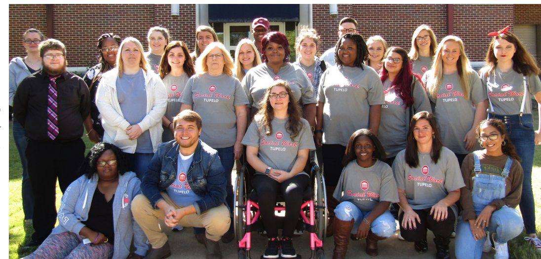
Members of the Student Social Work Organization

The Student Social Work Organization chooses community service projects throughout the year. Past projects include collecting nonperishable food items for local hospice agencies. The group also collected supplies and cell phones for soldiers, entertained residents at a local nursing home, raised money for the local Boys and Girls Clubs, adopted angels from the Salvation Army Christmas Tree, and collected supplies for a women's shelter.