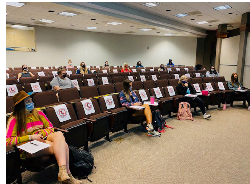
EDRD 355 class, Fall 2020

Should you need to reschedule a test, please cancel your existing appointment. Only after canceling your first appointment will you be able to register for a new time.