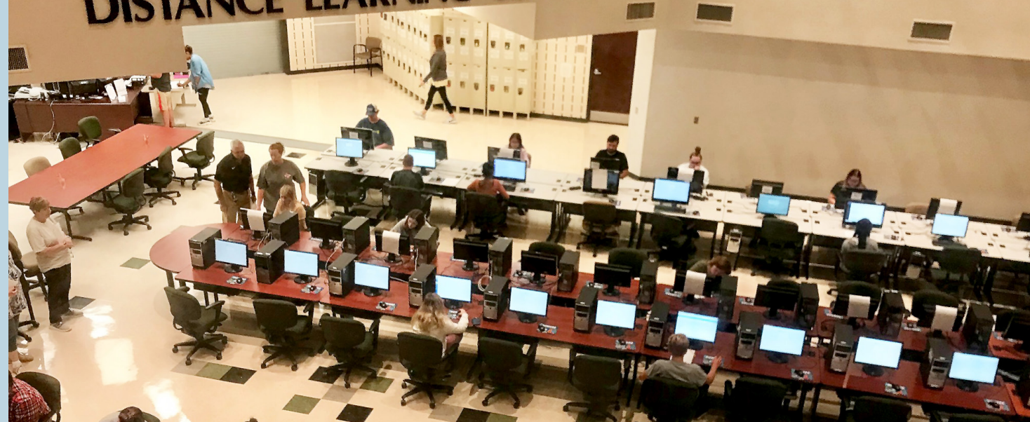
The ICC Distance Learning Center