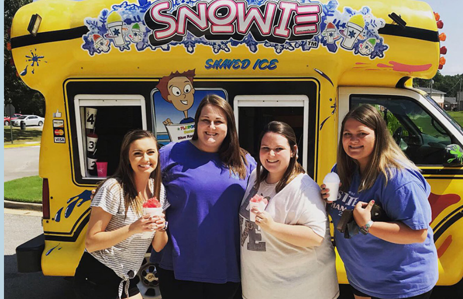
Welcome Back Snowcone Social