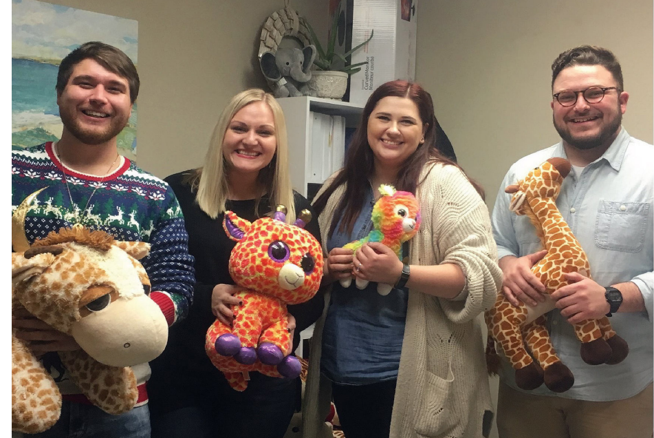
Student Social Work Organization stuffed animal drive

In case of an unofficial withdrawal, the school will determine the appropriate date of withdrawal to be that of the midpoint of the term, unless the student can document a different date. All students should be aware that withdrawing (either officially or unofficially) can adversely affect scholarships and grants (Academic Excellence, MTAG, etc.) for the next term of attendance. The Office of Financial Aid can provide guidance in those cases. Refund, repayment and withdrawal policies are subject to change, without notice, in order to comply with administrative and regulatory requirements.