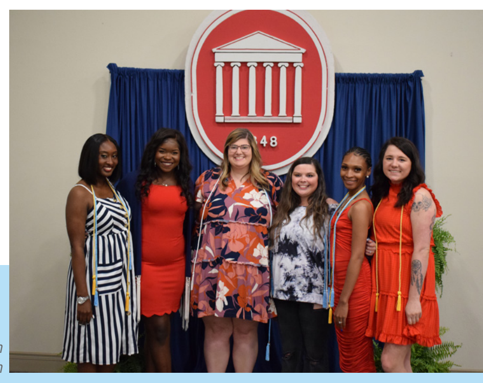
2022 Graduation Celebration

UMG follows the emergency and safety protocols set forth by the HCC campus. Emergency and safety posters are posted in offices and all classrooms on the HCC –Grenada campus.