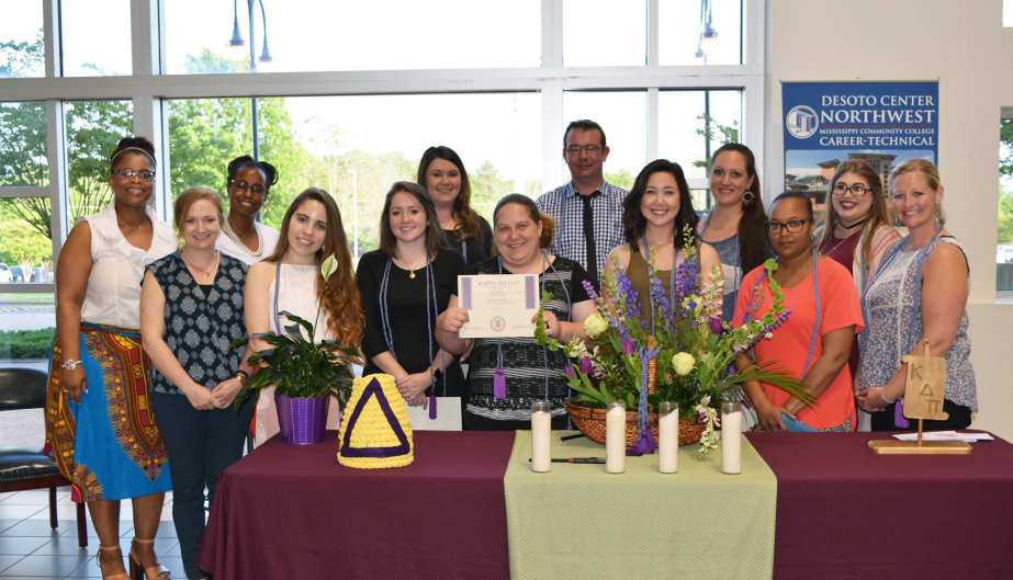
2017 Kappa Delta Pi New Inductees