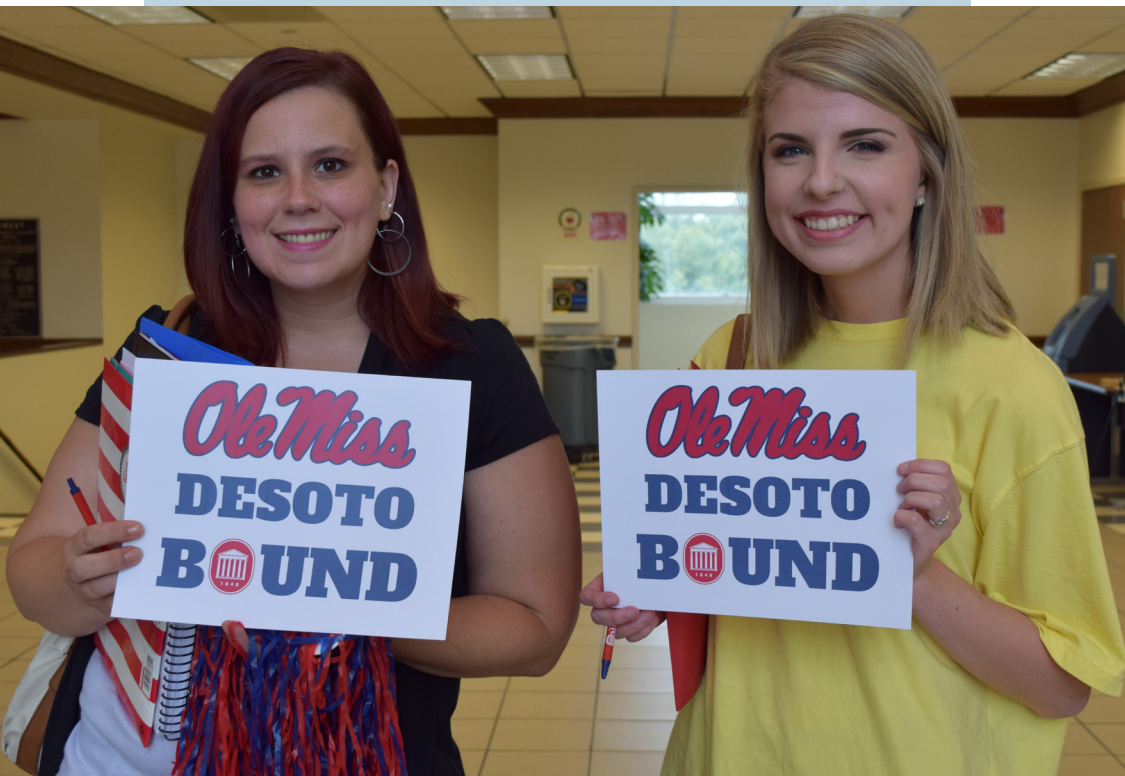
Orientation is held each semester for new students.