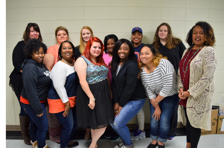
The Student Social Work Organization is for any student majoring in social work or for any student simply looking to get involved in community projects.

The Student Social Work Organization is a volunteer group through which students can develop a support network of peers, develop skills in organization, leadership, and volunteerism, and provide social work visibility within DeSoto County. The organization also works with social work majors from the Tupelo and Oxford campuses. All three campuses work together to build a strong student organization. One of the objectives for this group is to organize on-campus activities to raise awareness about social work in the community. The goal is to focus on a specific service organization and provide others with information about it. This past year the group sponsored their annual Social Work Forum, blending area agencies, faculty, and students. They also work closely throughout the year on projects that involve the Palmer Home children in our area.