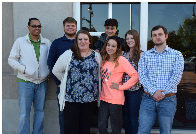
The student chapter of ISACA helps future professionals in areas such as accounting, information systems, and business connect with industry leaders.

Members are selected from the highest 10 percent of the class who meet these requirements. Inductions into the UM-DeSoto chapter of ASL are held each February.