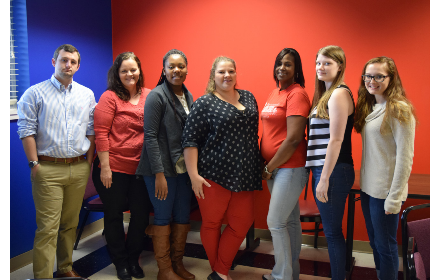
UM-DeSoto's Ambassadors represent the campus during many activities throughout the year including orientations, open houses, and student fairs.

University of Mississippi-DeSoto student ambassadors are chosen based on student involvement, grades, character, and passion for the University of Mississippi. As representatives for UM-DeSoto, they participate in activities on campus and recruiting events around the community.