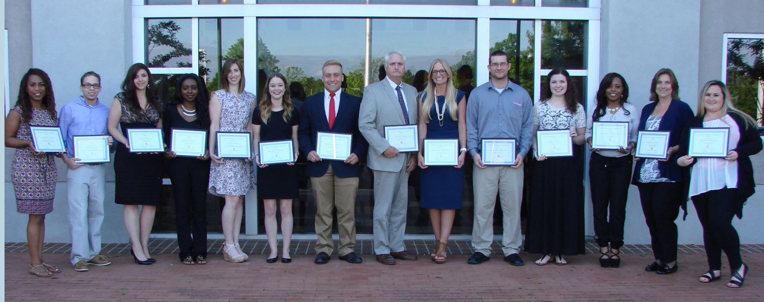
Our 2016 Outstanding Students