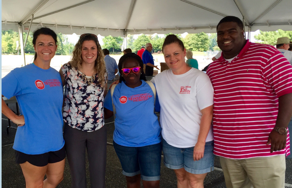
Staff and students volunteer at the Mobile Food Distribution.