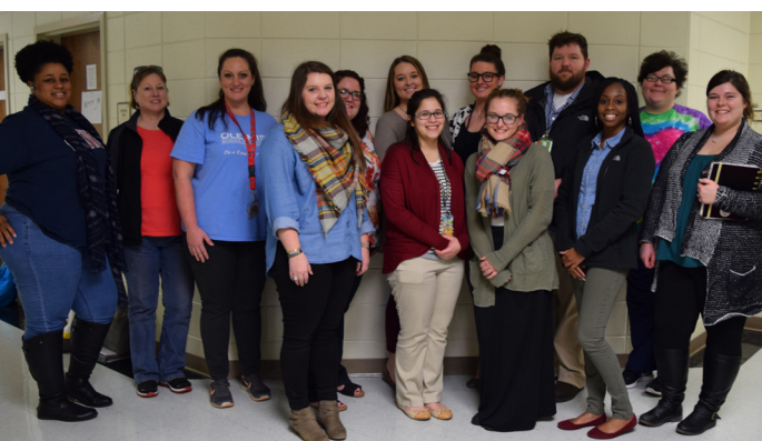
Teachers of Tomorrow is comprised of education majors and designed to help future educators develop an understanding of the profession.

Kappa Delta Pi is an international honor society that recognizes outstanding students in education. It works to foster support and growth for the education profession around the world. Each spring a new group of UM-DeSoto education majors are invited for induction into this organization.