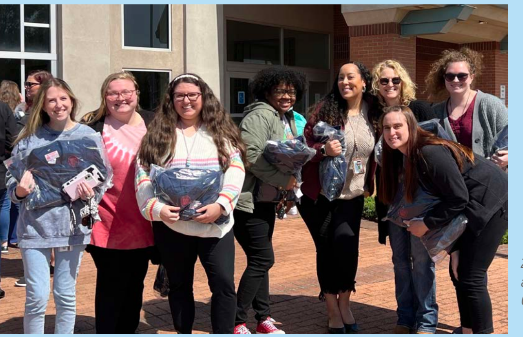
2022 Graduates at Cap and Gown Pickup

Diplomas are mailed to students after final grades have posted and all fees and exit paperwork has been completed.