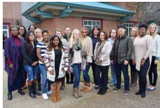
Student Social Work Organization