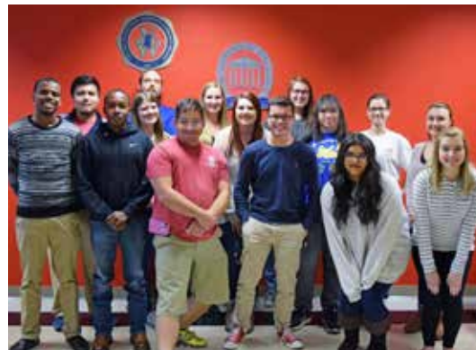
Phi Theta Kappa Alumni