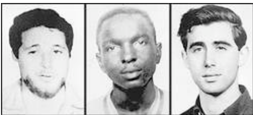
Schwerner, Chaney, and Goodman