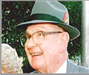
Byron De La Beckwith in 1994